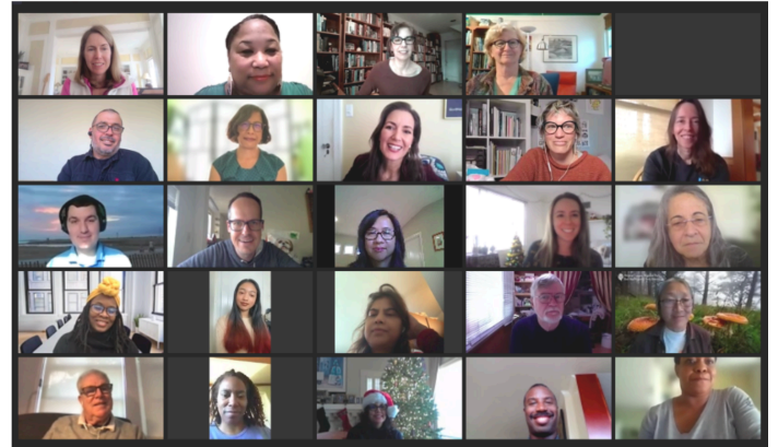
Zoom screenshot from the 9th Annual OPL Advocates' Holiday Mixer

I hope you share the pride I felt in celebrating the library, for the programs highlighted during the mixer would not be possible without the support we receive from the Friends of the Oakland Public Library. Your donations and membership dues make a direct impact on library programs and services, and I thank you for supporting our work through the Friends. We have a great deal to look forward to in 2022, starting on January 9 with the addition