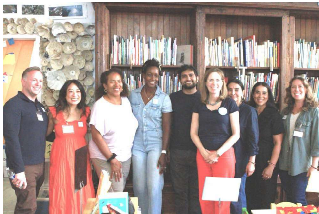
Friends of the OPL Directors