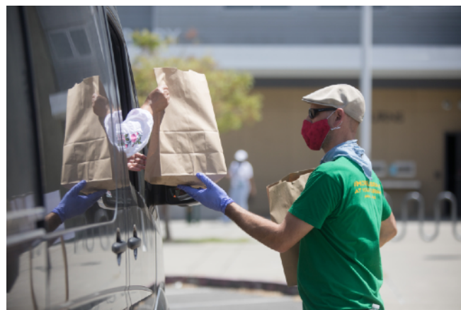
Food Distribution at 81st Ave. Library.

I hope that 2021 brings better days, but – no matter what happens – please know that OPL will continue to provide safe and dedicated service to Oakland.