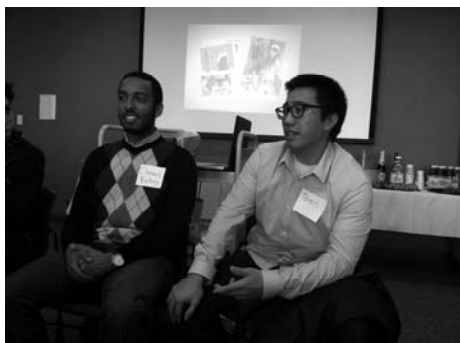
Photo: YLC alums answer questions from current members and offer advice.

gain formative experience readying them for college, work and civic advocacy. Thank you FOPL for supporting this important program!