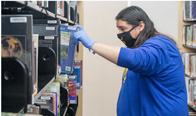
Library Staff preparing to welcome patrons back to OPL!

In addition, the African American Museum and Library at Oakland (AAMLO) and Oakland History Center (OHC) will be available for in-person visits and browsing. AAMLO will continue to require appointments for the archives, seed lending library, and group tours of the museum and the facility.