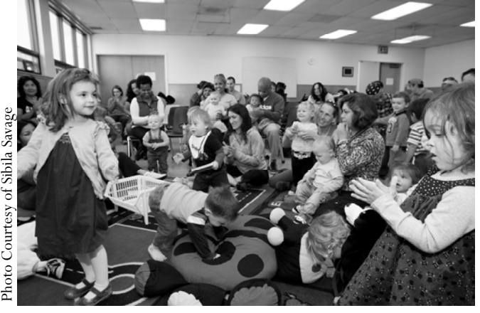
Dimond's Storytime drew a big crowd of little people.