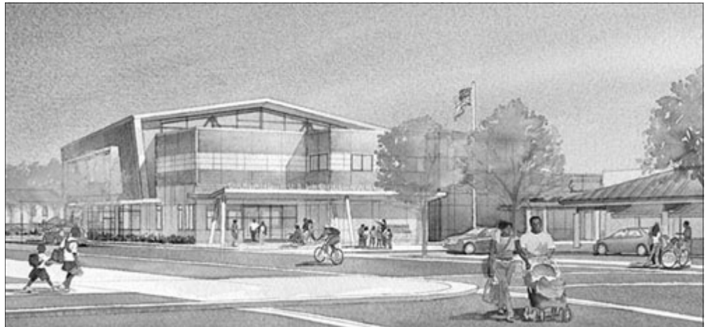
Artist's rendering of the East Oakland Community Library @ 81st Avenue

library in Oakland (July/August 2008 edition). For more information, please contact Winifred Walters , OPL’s manager of grants and development, at (510) 238-6932 .